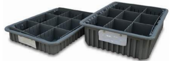
Above: P/2000 Shelving and HD Plastic Storage Bins. Left: Pipe & Ladder Shelves and Translucent Roof. Drop Floor at rear for lower 3-step entry.